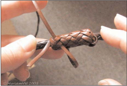
Fig. 33 - Under two, over two