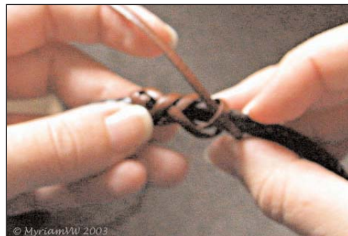
Fig. 6 - Now the braiding starts; under one, over two