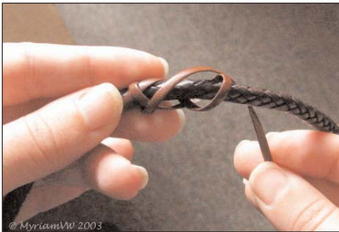
Fig. 3 - Bring the thong around again