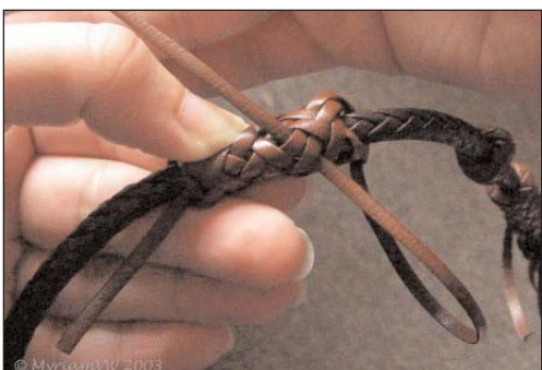
Fig. 23 - Under two, over two