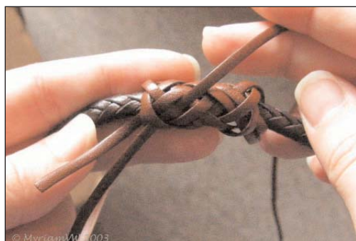
Fig. 16 - Over one, under two, over two