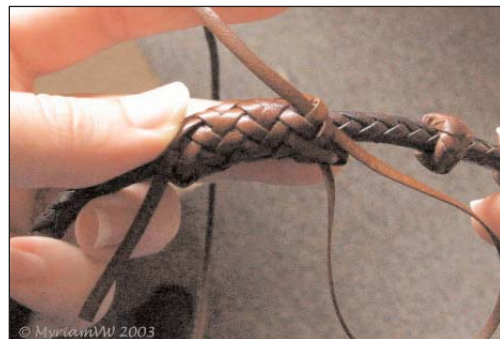
Fig. 30 - Under two, over two