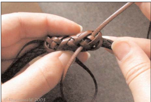
Fig. 21 - Over two, under two, over two