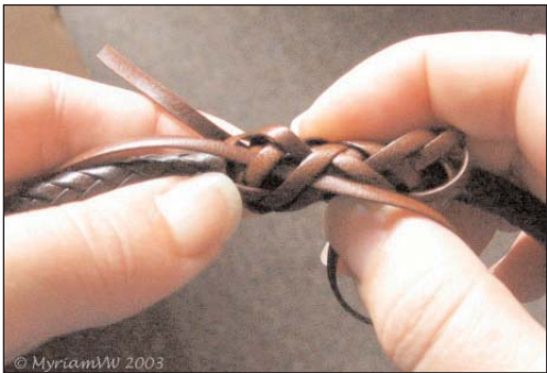
Fig. 19 - Over two, under two, over two