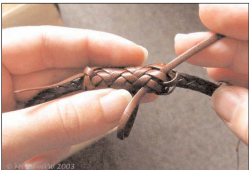
Fig. 29 - Under two, over two