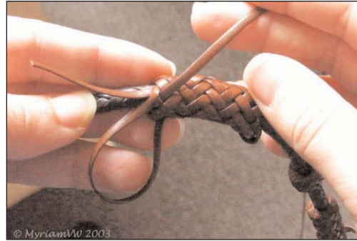
Fig. 26 - Under one, over two