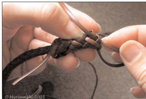
Fig. 22 - Under one, over two