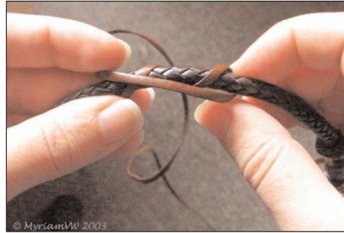
Fig. 2 - Bring the thong back over two