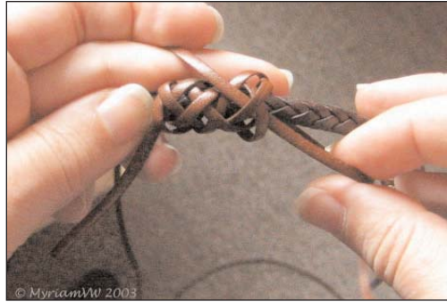
Fig. 10 - Under two, over two