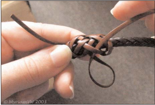
Fig. 9 - Under one, over two