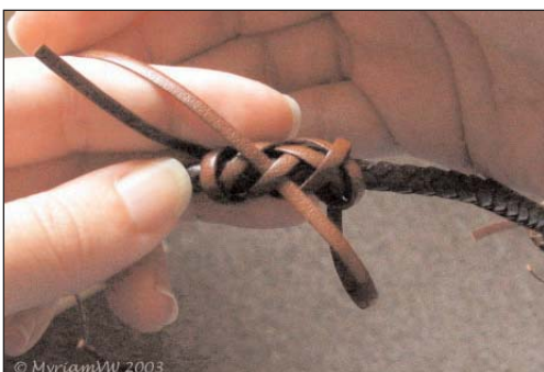
Fig. 7 - Under one, over two