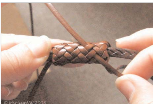
Fig. 31 - Under two, over two