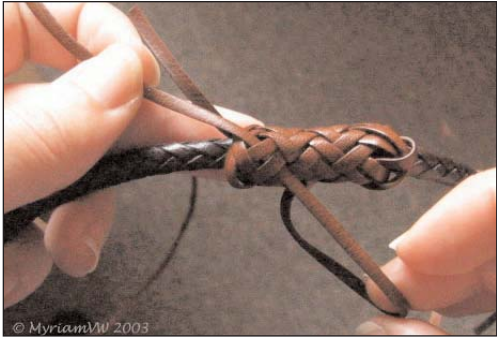
Fig. 25 - Under two, over two