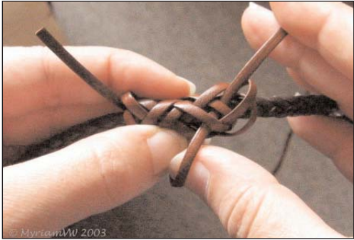
Fig. 17 - Over one, under two, over two