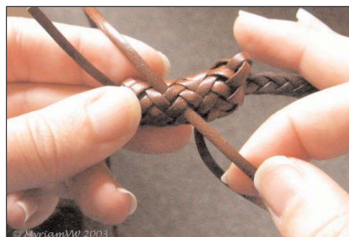
Fig. 32 - Under two, over two