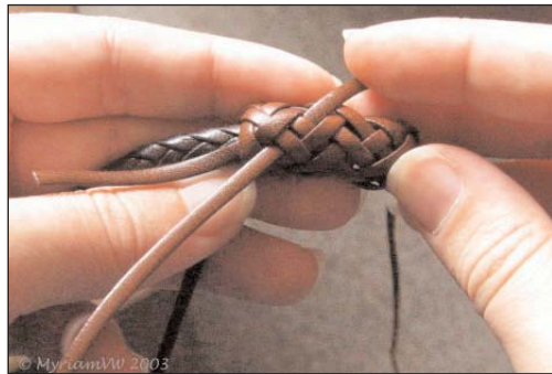
Fig. 20 - Over two, under two, over two