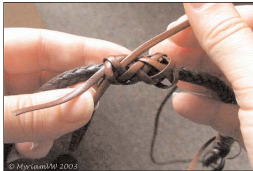
Fig. 12 - Under two, over two