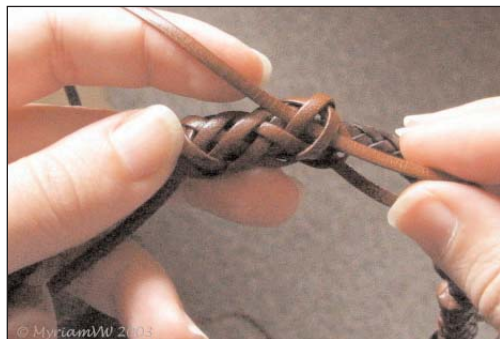
Fig. 14 - Over one, under two, over two