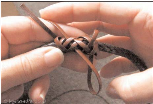
Fig. 11 - Under two, over two