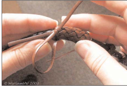
Fig. 34 - Under two; and this completes the knot