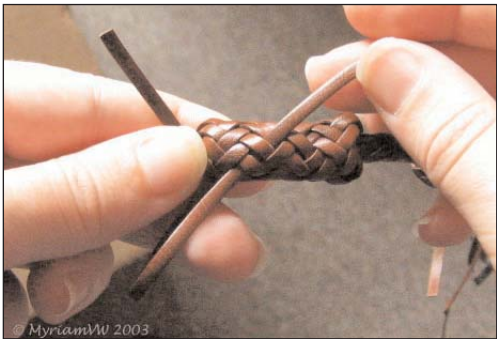
Fig. 27 - Under two, over two