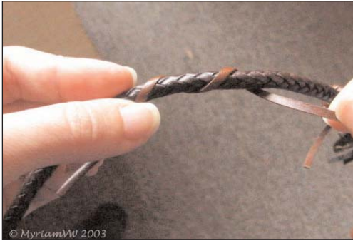
Fig. 1 - Wrap the thong one and one-half around