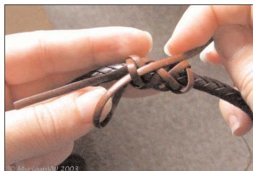
Fig. 8 - Under one, over two