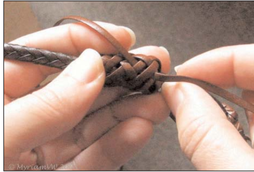
Fig. 18 - Over two, under two, over two