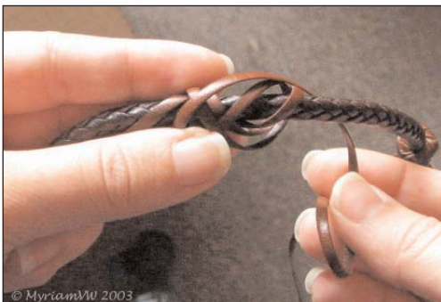
Fig. 5 - One more time, going over everything