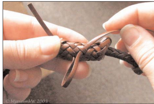
Fig. 28 - Under one, over two