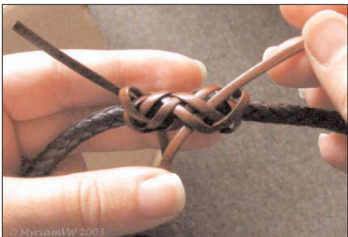
Fig. 13 - Under two, over two