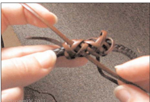
Fig. 15 - Over one, under two, over two