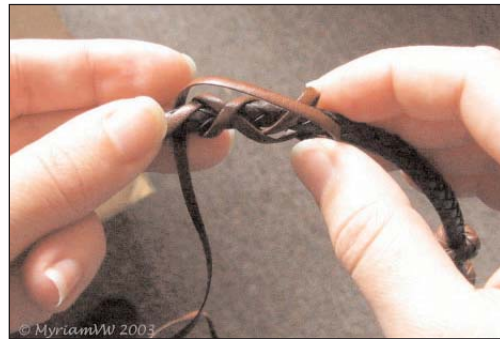
Fig. 4 - Still going over everything